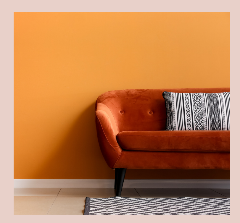
6. Soothe and comfort: When you're seeking comfort and emotional support, earthy tones such as brown and beige can provide a grounding and nurturing effect. These colors can create a sense of stability and security.

Remember, personal preferences and cultural associations can also influence the impact of colors on individuals. It's essential to experiment with different colors and observe how they make you feel personally. Additionally, using colors in your environment, such as in home décor or through visualizations, can also have a profound effect on your mood.